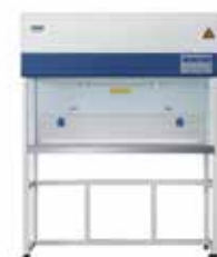
Clean Bench & Laminar Flow(Vertical)