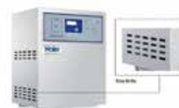
LN2 Backup System