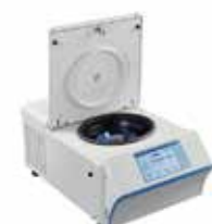
Desktop High-speed Refrigerated Microcentrifuge

To learn more or to speak with someone at Haier Biomedical, please visit www.haiermedical.com or call +86 -532 -88935593