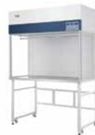
Clean Bench & Laminar Flow(Horizontal)

Haier Biomedical manufactures ergonomically designed and engineered scientific laboratory equipment providing personnel, product and/or environmental protection in critical research environments. Haier Biomedical extensive line of laboratory equipment includes: