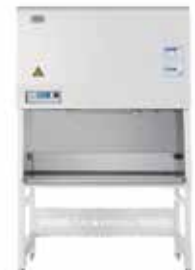
NSF Series Biological Safety Cabinet